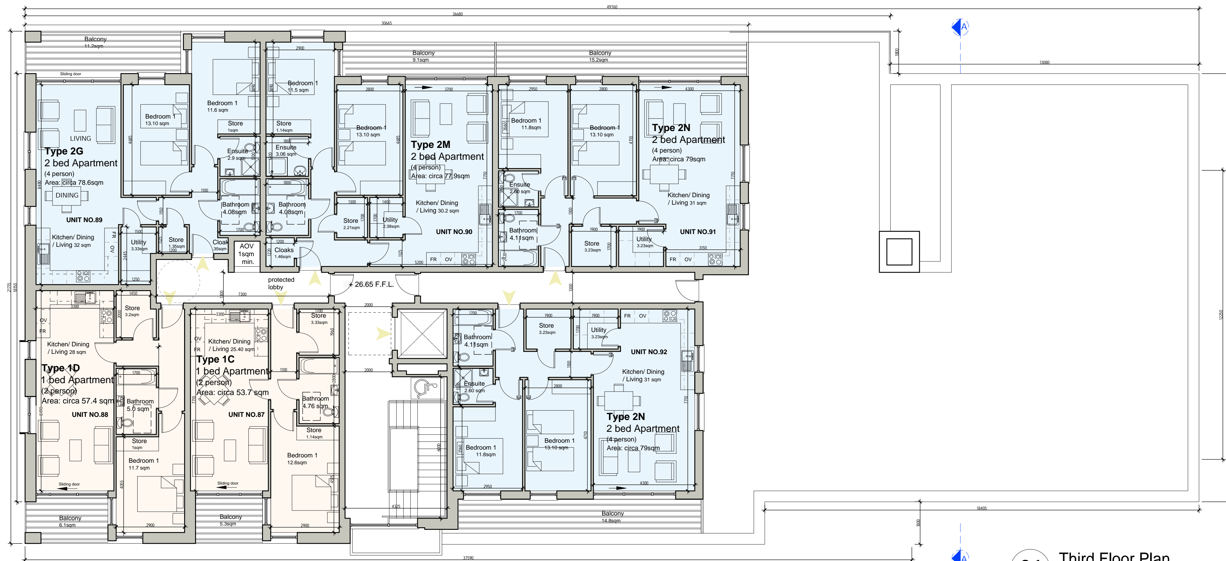
01 Third Floor Plan Scale 1:100 Area this floor: 870.9 sqm 9374 sqft

COMMERCIAL BLOCK TOTAL NO. = 29 Overall building area : 3,200.8 sqm / 34,446sqft