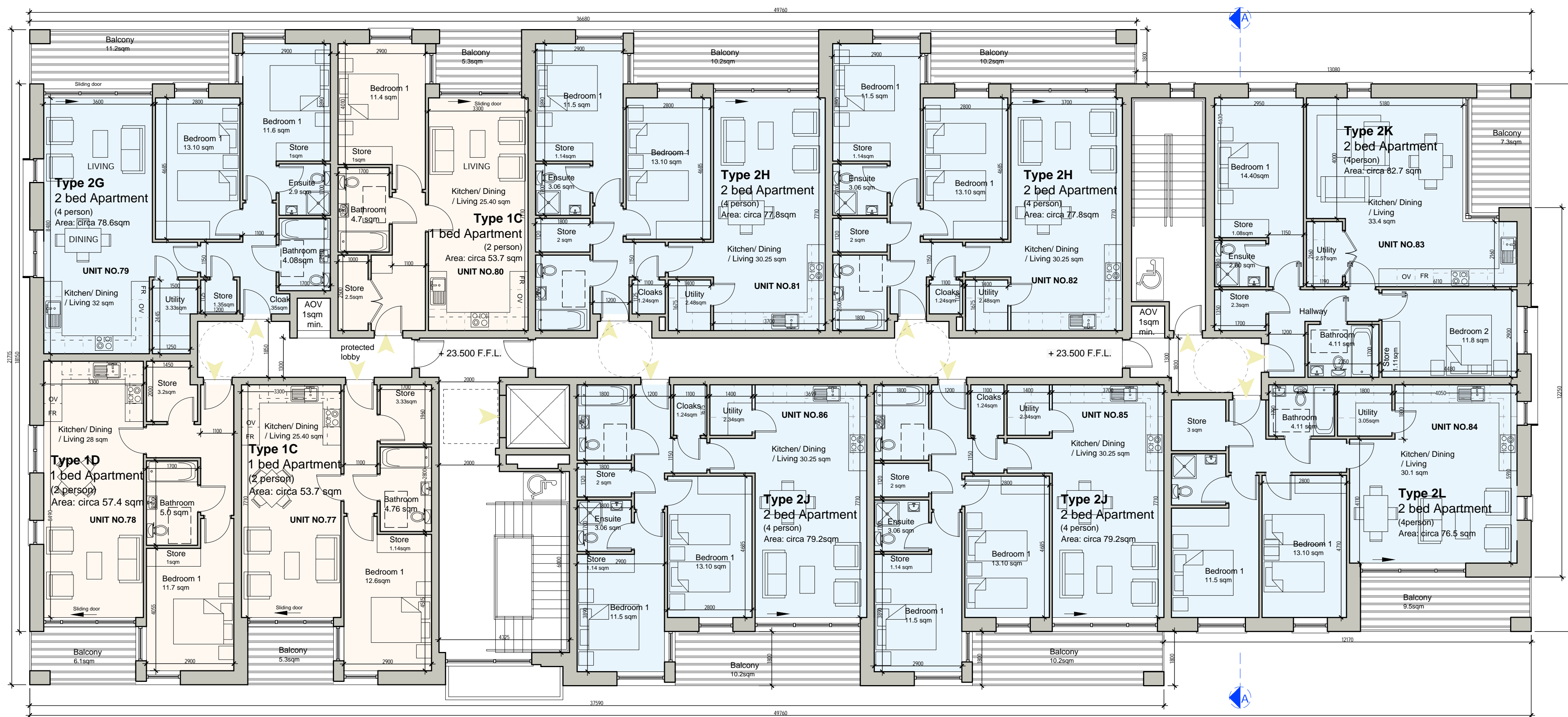
02 Second Floor Plan Scale 1:100 Area this floor: 870.9 sqm 9374 sqft